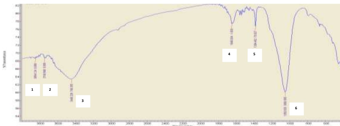
Figure 1. FTIR Test Results of Plantago major L.