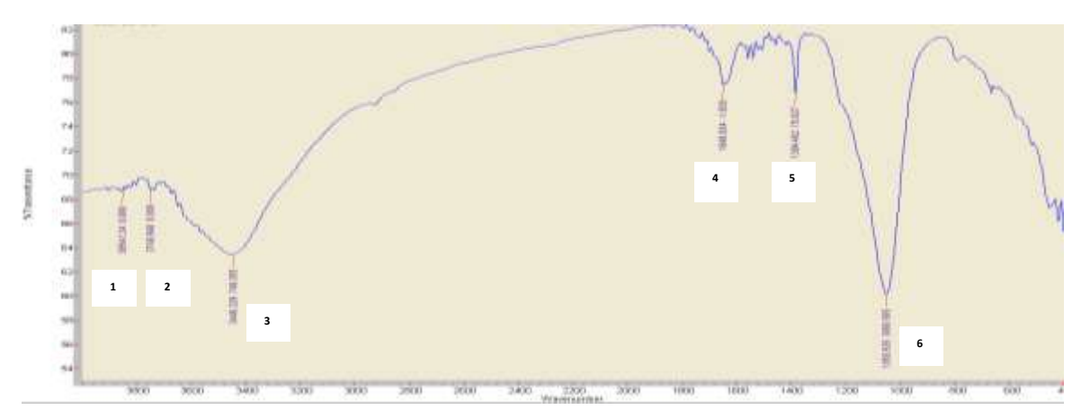
Figure 1. FTIR Test Results of Plantago major L.